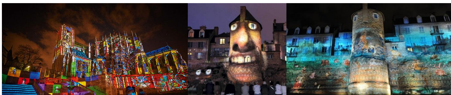
Overnight Le Mans

The Night of chimeras is an evening cultural event organized by the City of Le Mans. The principle is to illuminate the old town, to using holograms during the summer, from Tuesday to Saturday. Seven sites are highlighted in the Old Mans. It is proposed to spectator's free evening stroll to discover the architectural heritage. Projected graphics achievements are due to Skertzò. On the play, they tell the history of the Plantagenet town. These projections also reconstruct the life of the Middle Ages