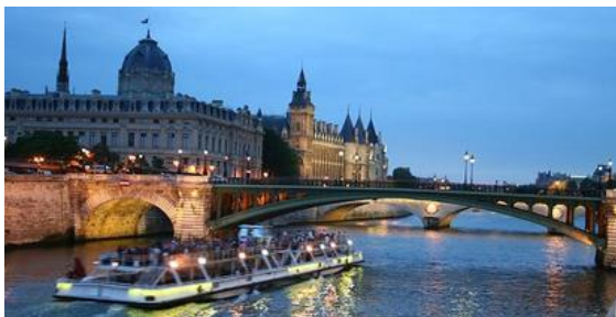
Overnight at Paris

10:00-11:00pm This evening take a night time cruise on the River Seine , passing many of Paris' most stunning monuments and districts Taking a tour of Paris by boat is unparalleled as experiences go. The city seems to fan out before you as you cruise down the river. You will see monuments including Notre Dame Cathedral and the Eiffel Tower. This is not an experience easily forgotten!